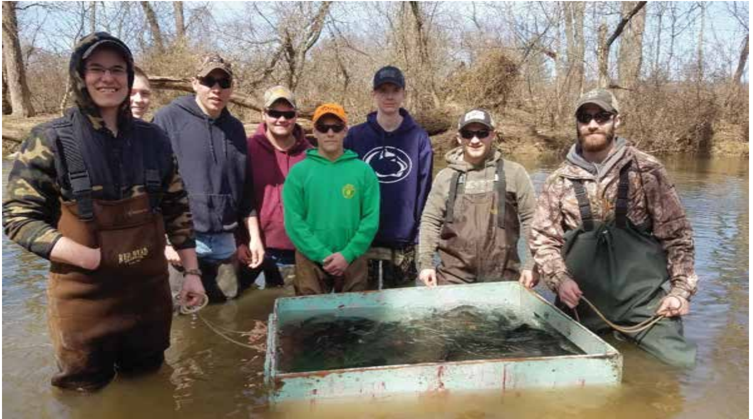
Biglerville High School students ready to learn first hand the art of float stocking

Float stocking trout in Adams County since 1976 has always played a major role in providing more fishing opportunities for anglers. Moving the trout downstream from different access points has major benefits, especially with the social distancing due to Covid19. Since March our stocking volunteers have been taking a backseat with the PFBC in the stocking program. Hopefully, in January at the PFBC meeting, a new plan will be adopted for volunteers to get their feet wet again following the protocols adopted for the volunteers. If approved, each float stocking section will be viewed separately to maintain social distancing and protection for everyone. 🐟