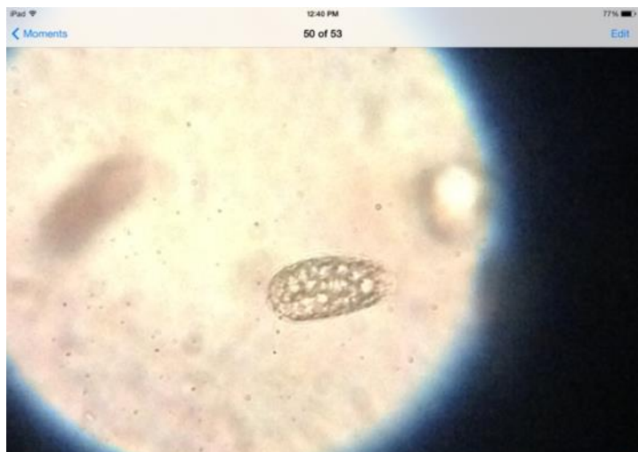
Ich parasite under a microscope

So what to do? In warm tropical tanks (75 degrees plus) the parasite lifecycle will repeat itself every four days and can be treated with a couple of products including aquarium salt. The salt will kill the free swimming young parasites and the cycle can be broken..... but wait.. if you have trout, you have a much cooler tank, roughly 50 degrees and the cycle may tank up to three weeks. With that being said, you must be patient and continue to add aquarium salt diluted in a 5 gallon bucket of water every 4 to 5 days for a three week period. Continue to vacuum bottom of tank top to remove dead parasites. I was very skeptical of this procedure because it would take so long and I really did not think I would have any trout left in the tank by end of three weeks. So we took this as a learning opportunity and figured we would see what happens. Well to end on a happy note, we actually had trout survive. I continued with the treatment for 4 weeks and the remaining trout look great and the water quality is excellent. So if you ever have "Ich" in your trout tank, don't give up. Treat with aquarium salt and be patient! You may be surprised by the results!