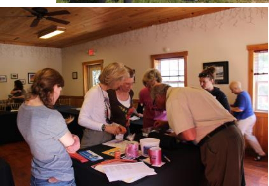
Sponsors and Partners for Women, Wine & Waders - We thank you for your support!