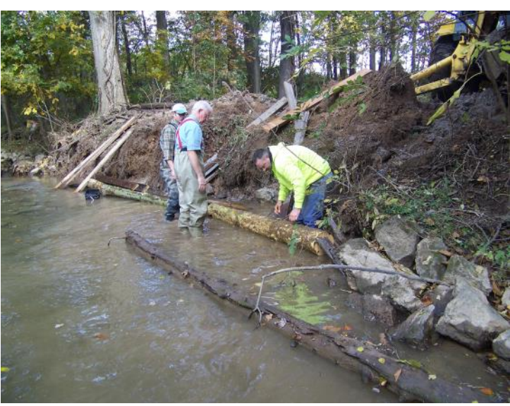
Above: Working on placing logs for the device.